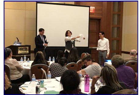
Pictured: 2018 Annual Meeting at the Long Beach Marriott on September 14, 2018